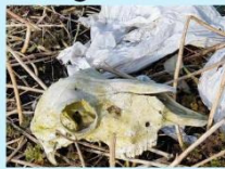
left silage plastic

The Landskrona Municipality punishes the critics by misuse of the legal system